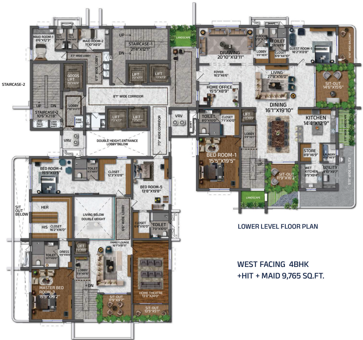
LOWER LEVEL FLOOR PLAN

WEST FACING 4BHK +HIT + MAID 9,765 SQ.FT.